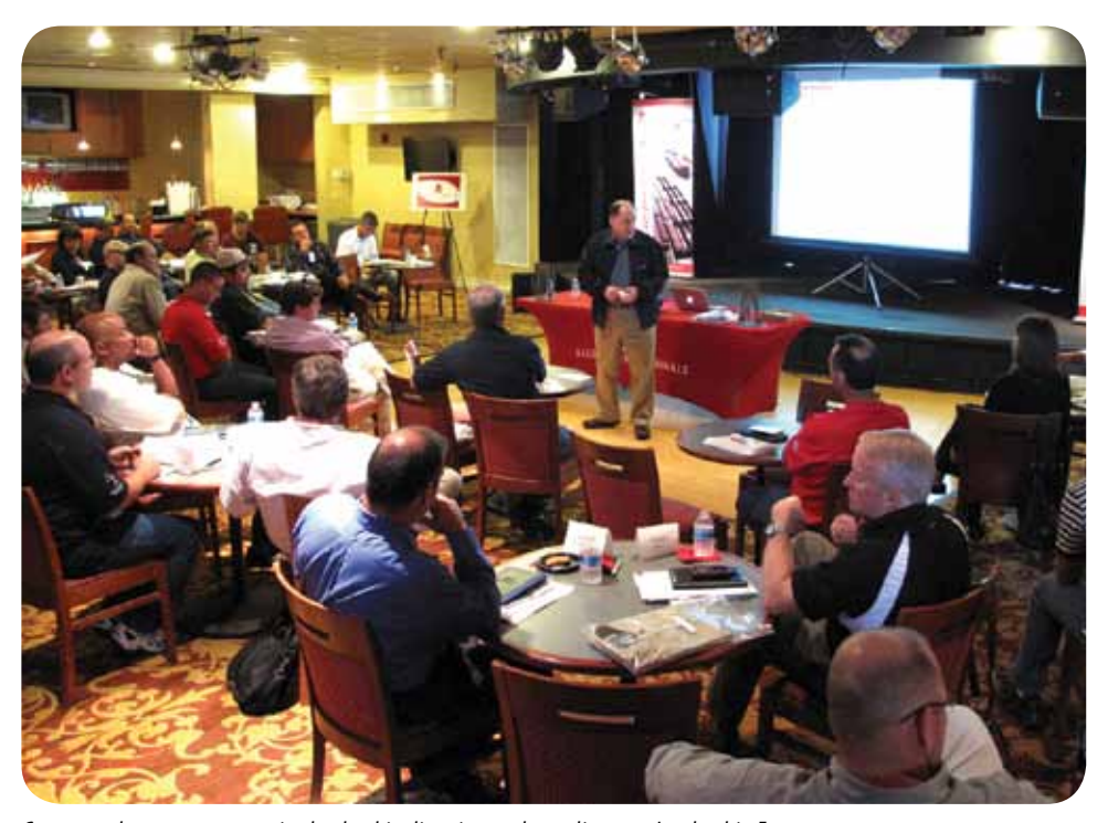
Guest speaker, presents creative leadership direction to the audience at Leadership Forum.

A corporate training and development firm has been engaged to develop and instruct the leadership training program for Associated Terminals. This firm is dedicated to equipping workers with the people skills and personal values that enable them to achieve the goals of their company.