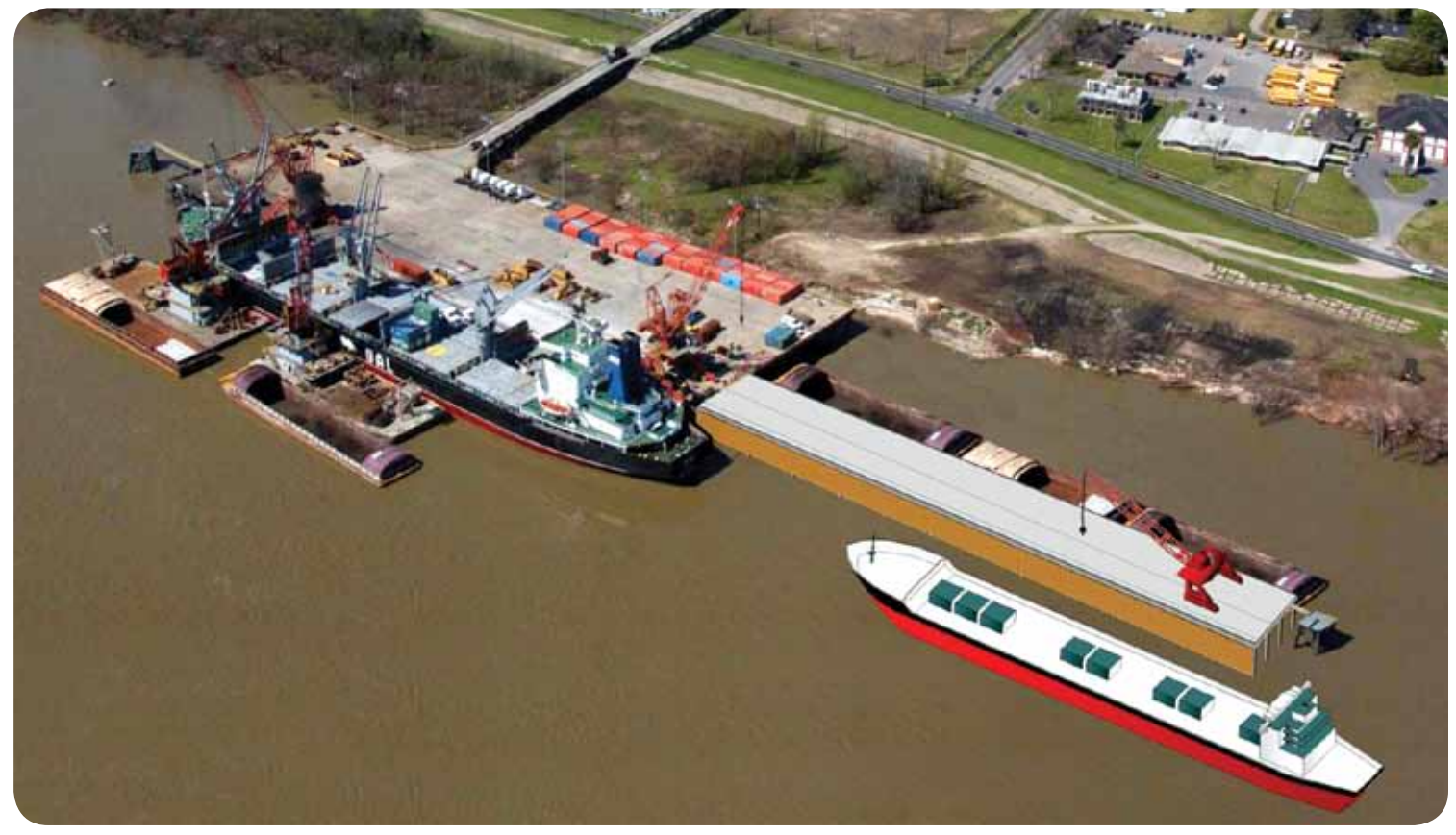
A 3D artist rendering of new finger pier downriver from the existing general cargo dock.

arlier this year, construction commenced on a dock extension at the Port of South Louisiana's Globalplex facility. The 65 ft. wide by 700 ft. long new finger pier will be adjacent and downriver from the existing general cargo dock. This expansion will allow the Globalplex facility to have two Panamax size vessels in berth simultaneously.