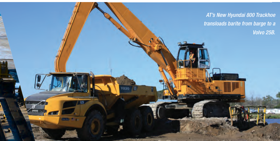
AT’s New Hyundai 800 Trackhoe transloads barite from barge to a Volvo 25B.