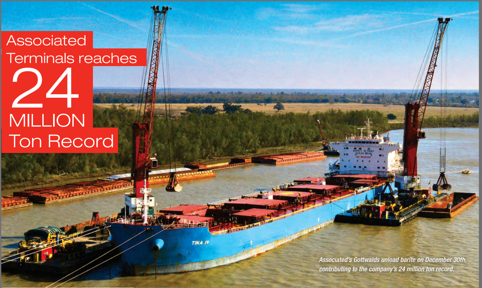
Associated's Gottwalds unload barite on December 30th, contributing to the company's 24 million ton record.

Associated Terminals reaches 24 MILLION Ton Record