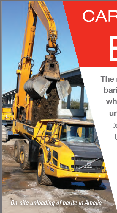
On-site unloading of barite in Amelia

Associated transloaded more than one million metric tons of barite in 2012 and continues to be the leading handler of barite on the lower Mississippi River and at processing terminals in South Louisiana.